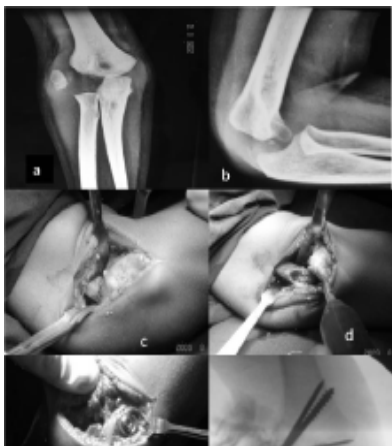
Figure 2 - case of displaced lateral condyle fracture(a,b) exposed via lateral approach (c) . the rotated fragment is cleaned and fixed using a screw and 2 K wires.