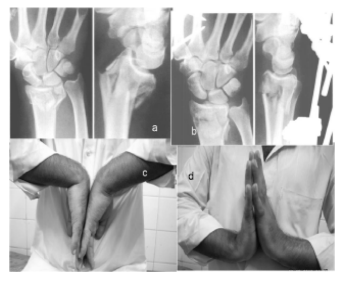
Figure 1a. 30 y/o, C2 type fracture of left side (Case 10) treated by use of External Fixator (1b). Follow up at one year showing good functional outcome (c,d)